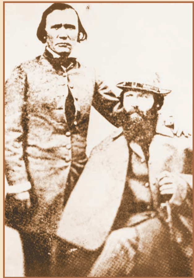
Kit Carson and John C. Fremont. Kit Carson was Fremont's guide on the expedition that literally put Las Vegas on American maps.

Bridger, a famous mountain man and fur trader, is credited with many accomplishments, including the first explorations of the Great Salt Lake. His closest approach to Southern Nevada might have been a brief trapping foray along the Humboldt River in Northern Nevada. Two of Bridger's associates, more worthy of recognition in Southern Nevada, have yet to be memorialized in street names. Fur trapper Jedediah Smith made path-breaking explorations in Southern Nevada in the 1820s, and famed black mountain man Jim Beckwourth crossed through Las Vegas Valley a time or two in the 1840s.