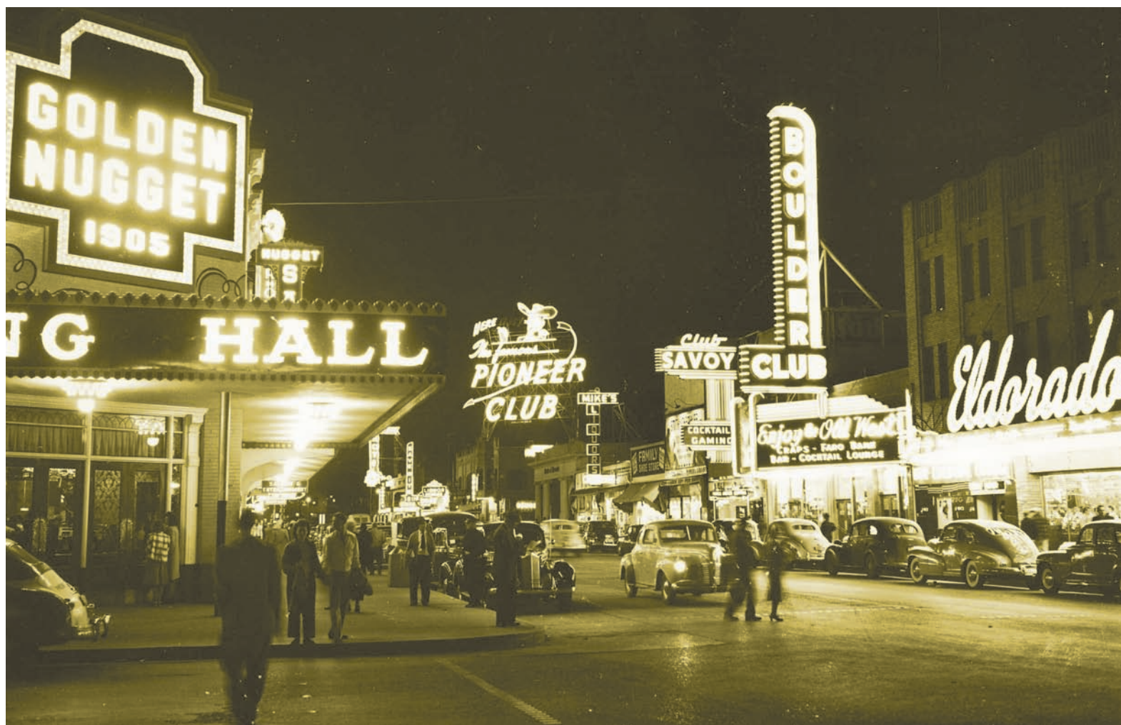
Fremont Street in 1949. The street bears the name of the intrepid explorer.