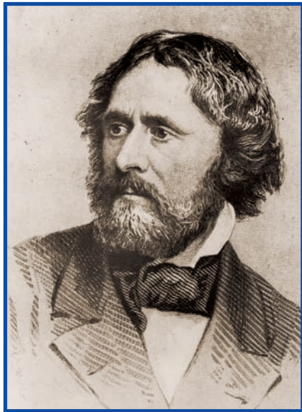
John C. Fremont

called the Great Basin. His journal entry for May 3 gives us one of our earliest glimpses of Las Vegas. “We camped,” he said, “at a camping ground called Las Vegas — a term which the Spanish use to signify fertile or marshy plains. Two narrow streams of clear water, four or five feet deep, gush suddenly with a quick current, from two singularly large springs. They afforded a delightful bathing place.”